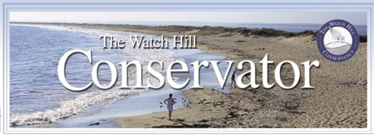
THE WATCH HILL CONSERVANCY NEWSLETTER