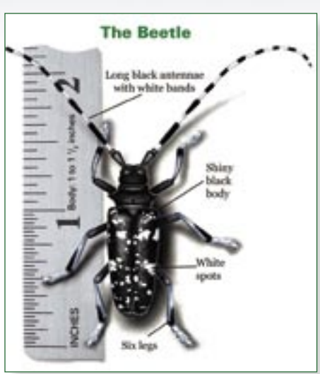
Illustration courtesy United States Department of Agriculture

Approaching Watch Hill, visitors and residents alike are struck by the variety of trees that line the streets and roads, provide privacy for summer homes, or serve as focal points in gardens and designed landscapes. Oaks, beeches, maples, evergreens – these and others provide shade and variety of color and form yearround. It's easy to take them all for granted, but hard to imagine Watch Hill today without them